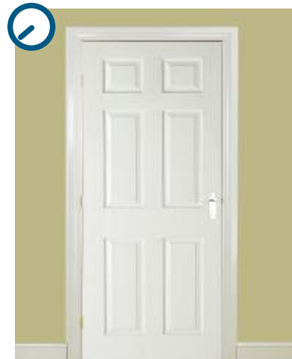
FINISHED DOOR INSTALLATION