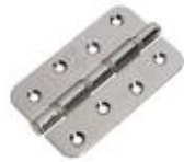
BRIGHT NICKEL OR SATIN