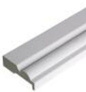
TORUS (69 & 59MM)