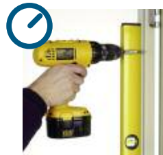
STEP 3 – ENSURE FRAME IS SQUARE AND PLUMB