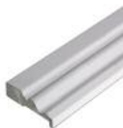
OGEE (69 & 50MM)

MDF architrave is supplied foil-wrapped in white and is available in a choice of four styles. Architrave is pre-cut to length with a Hoffmann joint pre-machined.