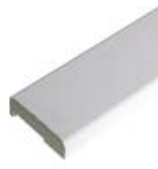
TWICE ROUNDED (69 & 45MM)