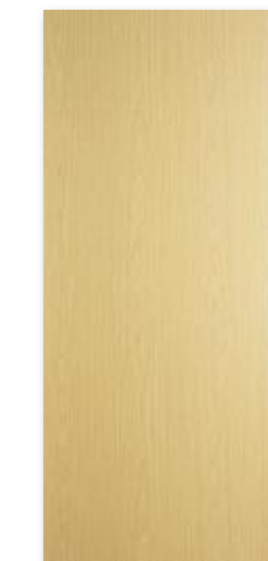
Ash Foil Veneer