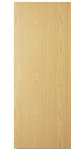
Oak Foil Veneer