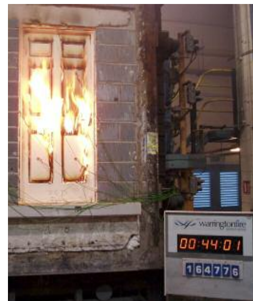
30-minute fire protection exceeded comfortably with 44 minutes showing on the clock before the fire broke through the prototype door under test.

JELD-WEN UK Retford Road, Woodhouse Mill, Sheffield, South Yorkshire, S13 9WH T: 0845 122 2890 | F: 0114 254 2365 E: marketing@jeld-wen.co.uk www.jeld-wen.co.uk